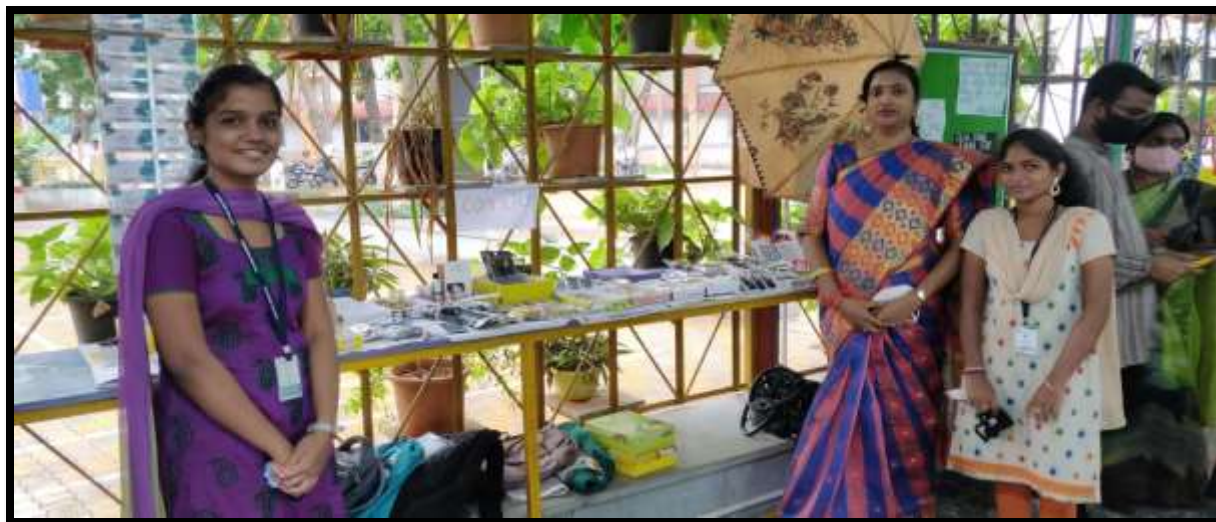
PHOTOS FROM THE MELA